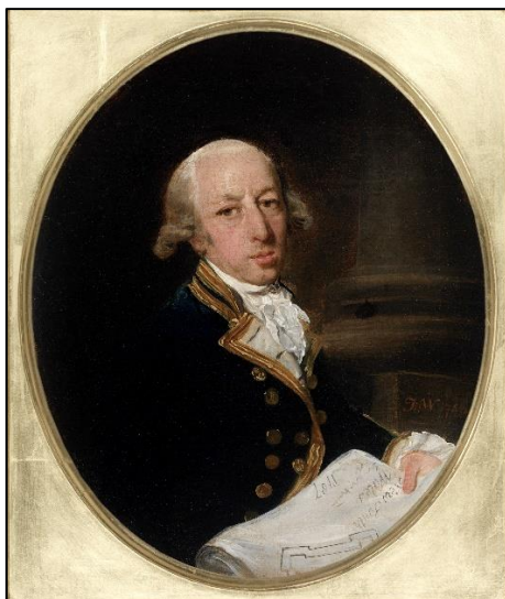
Captain Arthur Phillip

The First Fleet, sent out for the purpose of settling Australia with convicts, departed England in May 1787 and arrived in New South Wales in January 1788. The commander of the fleet and first Governor was Capt. Arthur Phillip, who had important connections and contacts with Portugal that greatly facilitated the settlement of Australia. 8