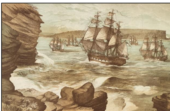
(Top) The 1 st Fleet in Rio de Janeiro; (Bottom) Entering Port Jackson