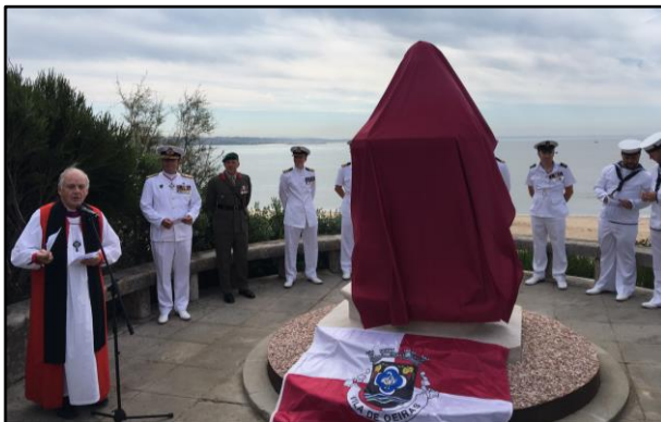
Right Reverend Dr Barry Morgan leads the service of rededication

The service was conducted by The Right Reverend Dr Barry Morgan, Archbishop of Wales 2003-2017.