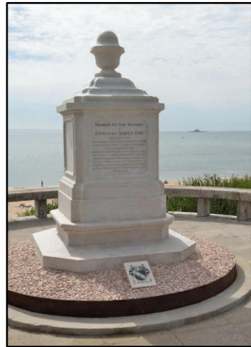
The monument before (left) and after (right) the restoration of 2017