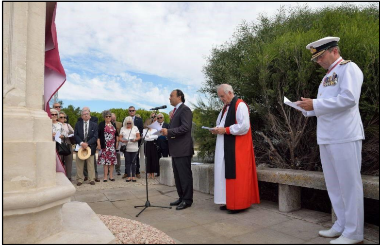
The address by the Mayor of Oeiras, Paulo Casinhas da Silva Vistas

After the rededication, the Oeiras Câmara generously provided canapés and drinks on the Promenade. Invited guests then made their way to the Adega do Palacio de Marques do Pombal for a wine tasting followed by